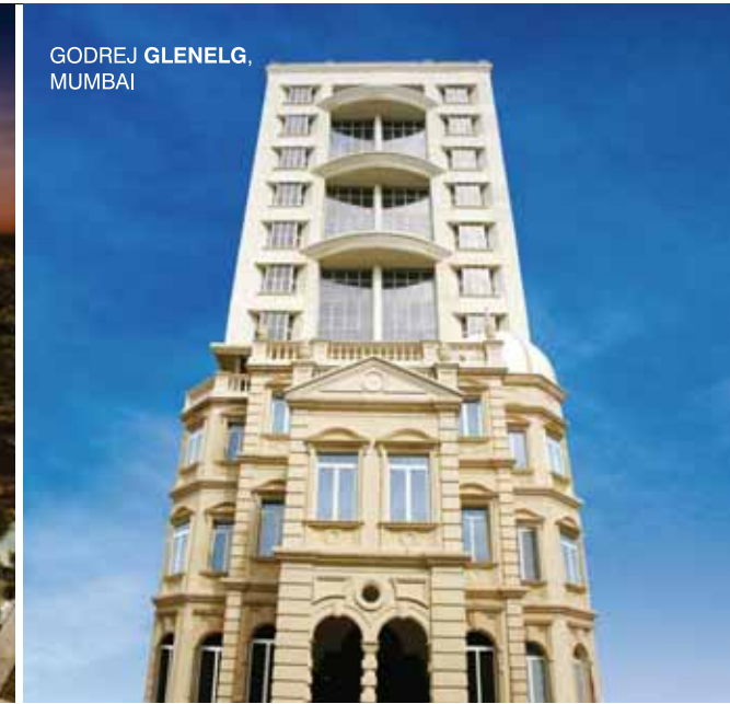
GODREJ GLENELG, MUMBAI