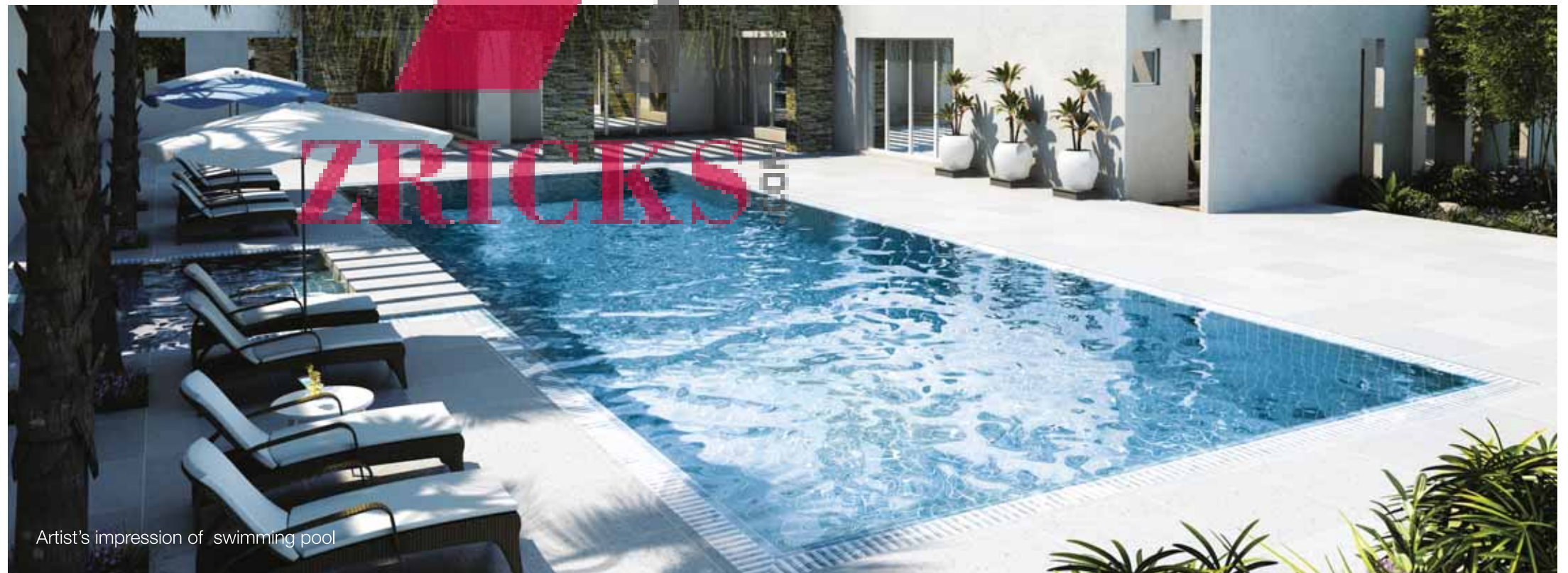
Artist's impression of swimming pool