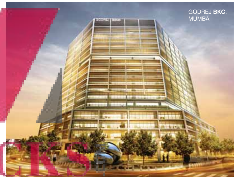
GODREJ BKC, MUMBAI