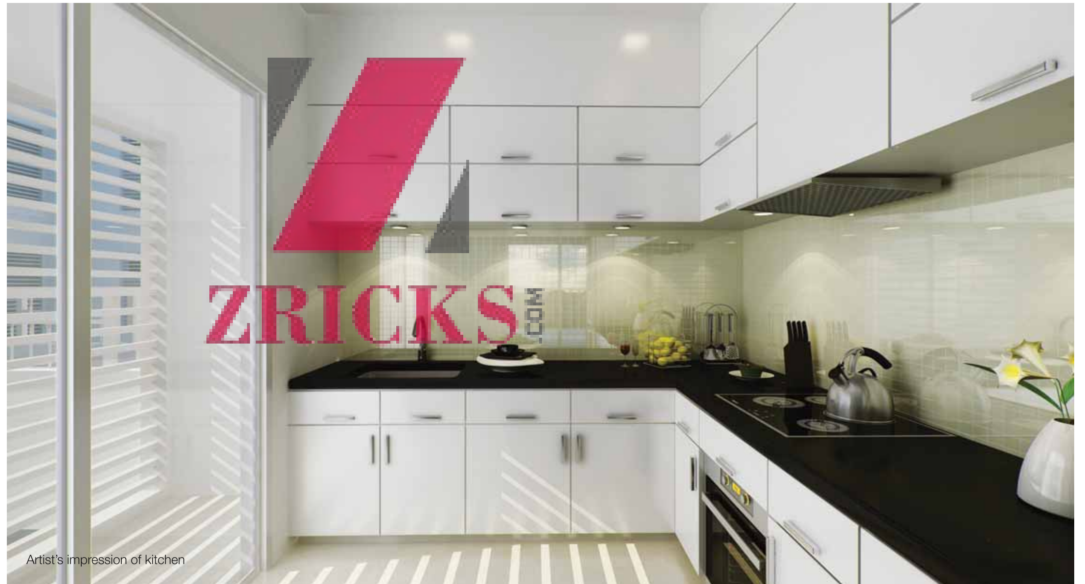
Artist's impression of kitchen

Now you can cook your favourite food, share intimate family meals, and invite your friends over for a home-cooked gourmet experience.