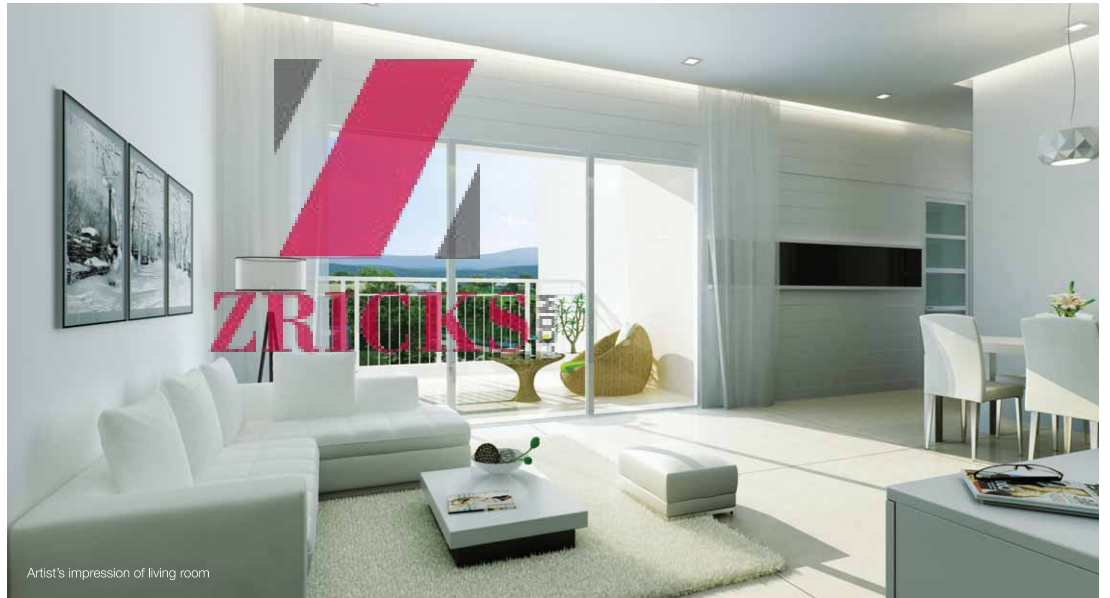
Artist's impression of living room

The first emotion that crosses your mind when you step into the living room is the sense of openness and space. Designed to create a lavish, modern and functional living space, the intelligently planned layout uses natural light to create a lively ambience. The insulated sliding windows block the noise and clamour of the city, achieve maximum ventilation and provide a refreshing moment of solitude.