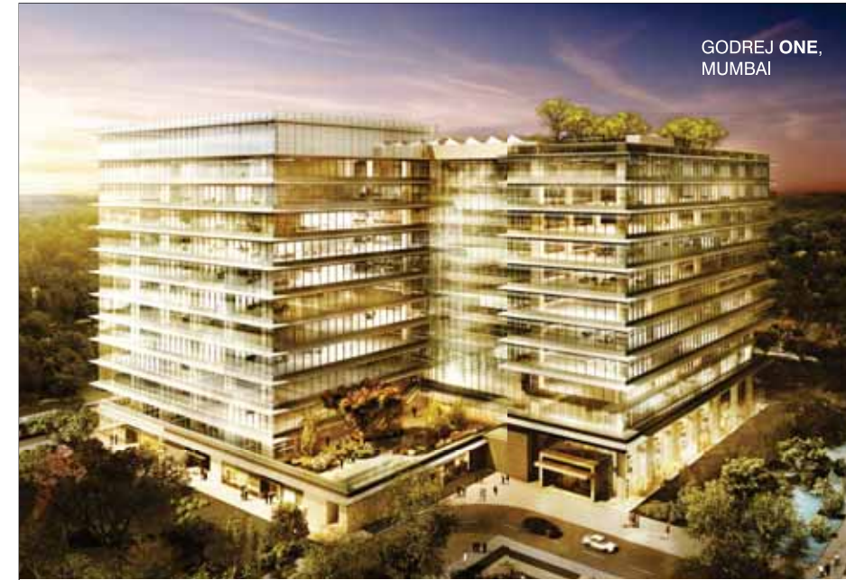
GODREJ ONE, MUMBAI