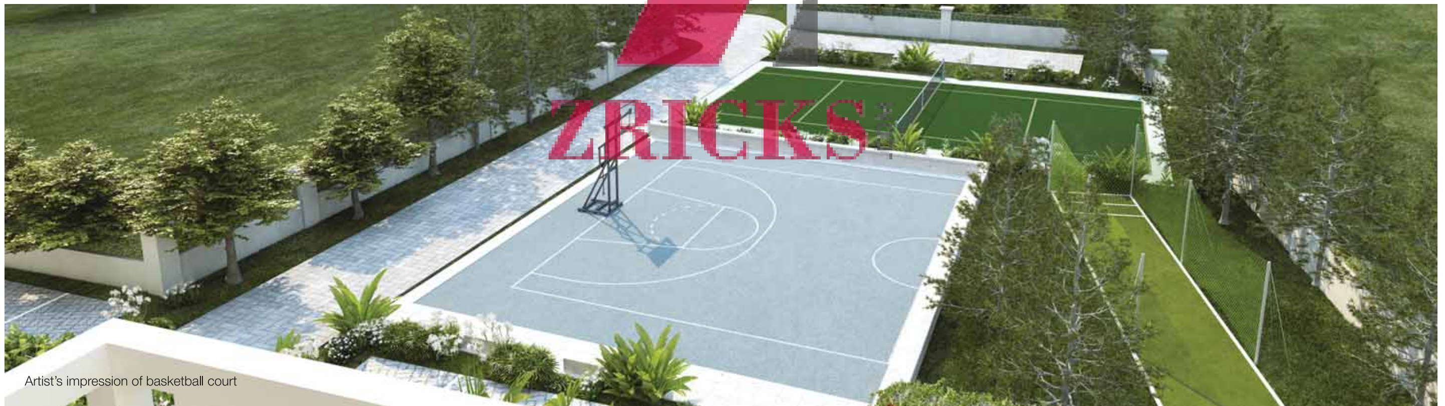
Artist's impression of basketball court