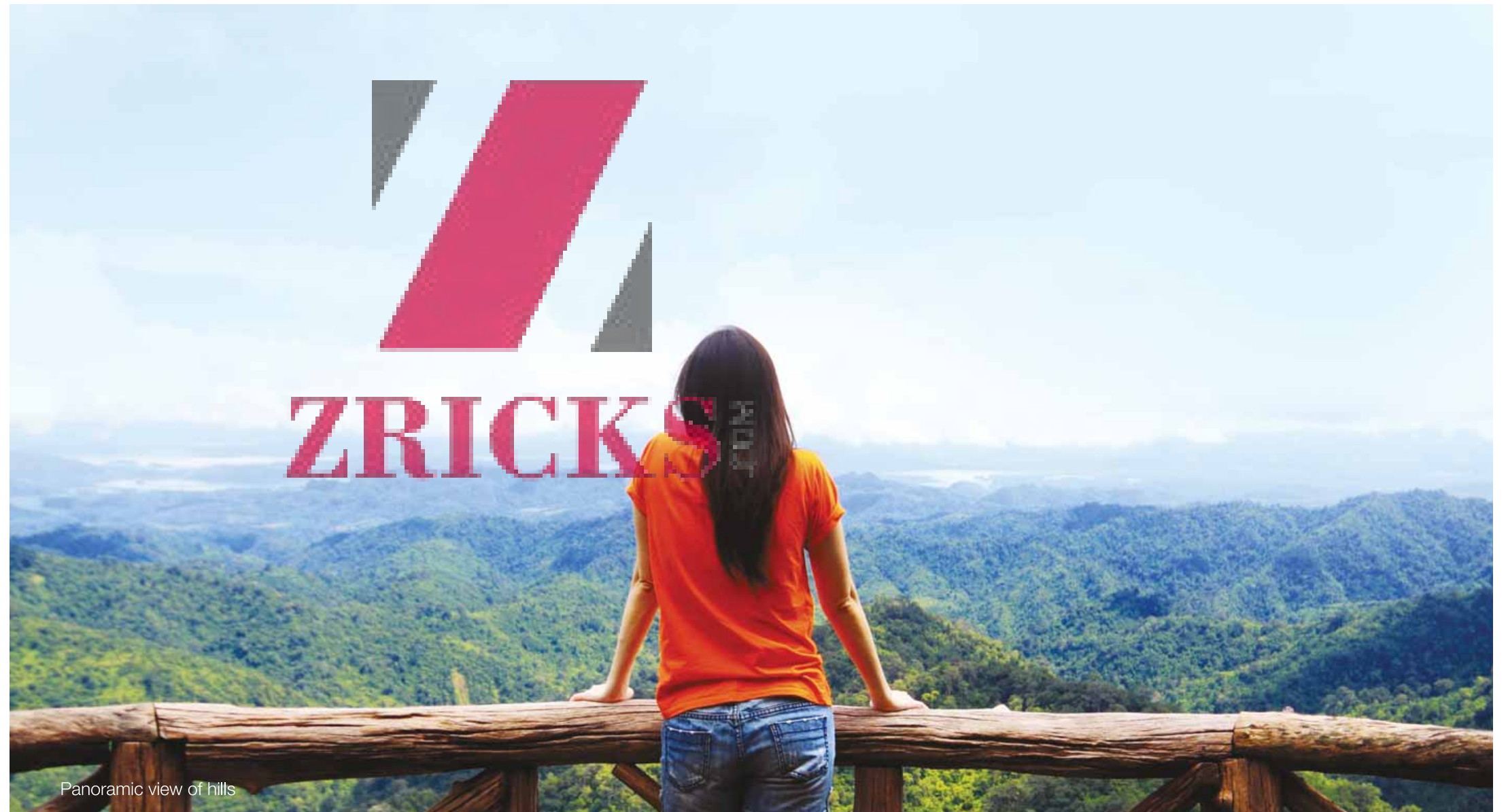
Panoramic view of hills

Now, the top floor isn't the only place from which to enjoy the uninterrupted view of the green hills and the bustling city below. Step into your balcony and the panorama will unveil.