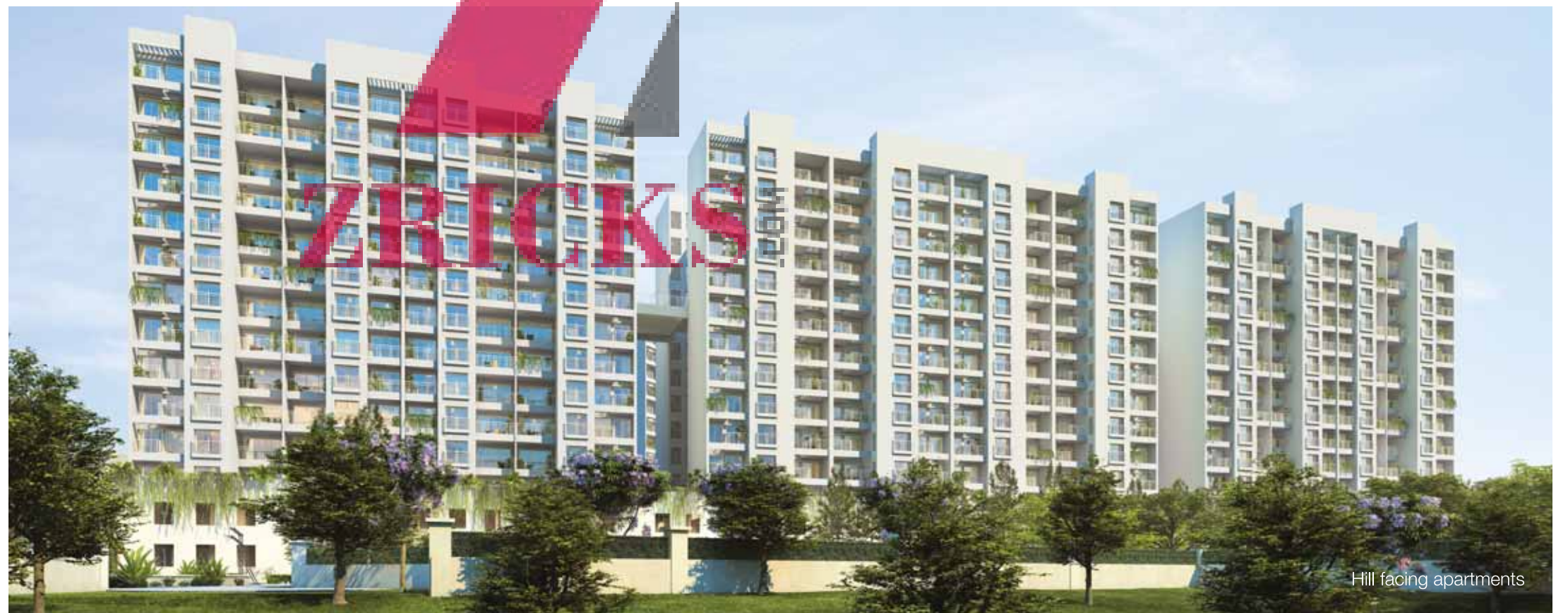
Hill facing apartments