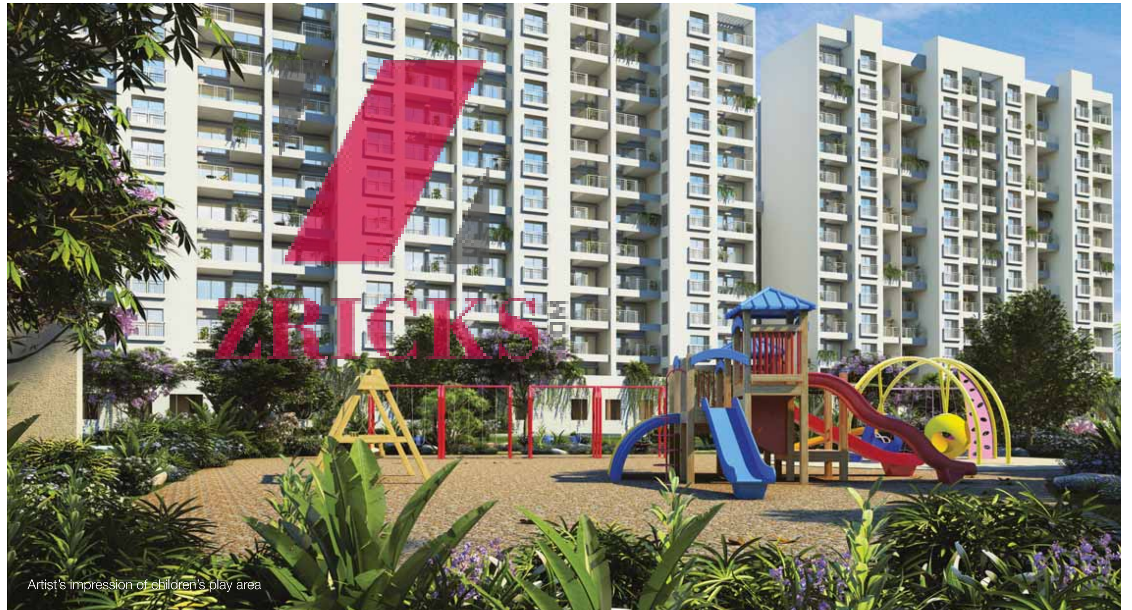
Artist's impression of children's play area

A well-equipped play area with a tree house and slides is an ideal and secure atmosphere for kids. Let them experience the joy of playing outdoors, make new friends, and learn to chase butterflies. After all, nothing ever compares to the look of joy on your child's face.