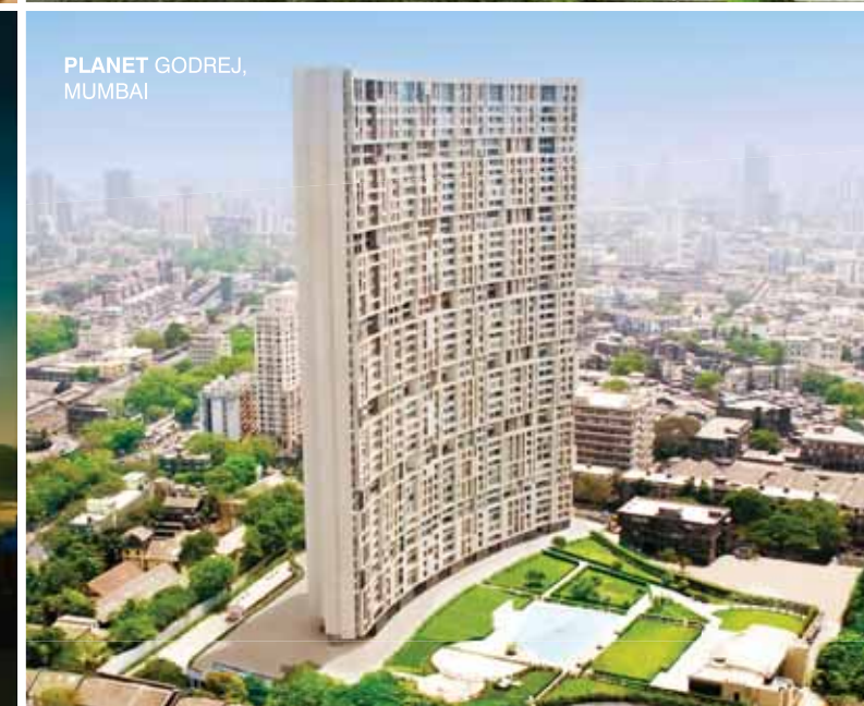
PLANET GODREJ, MUMBAI