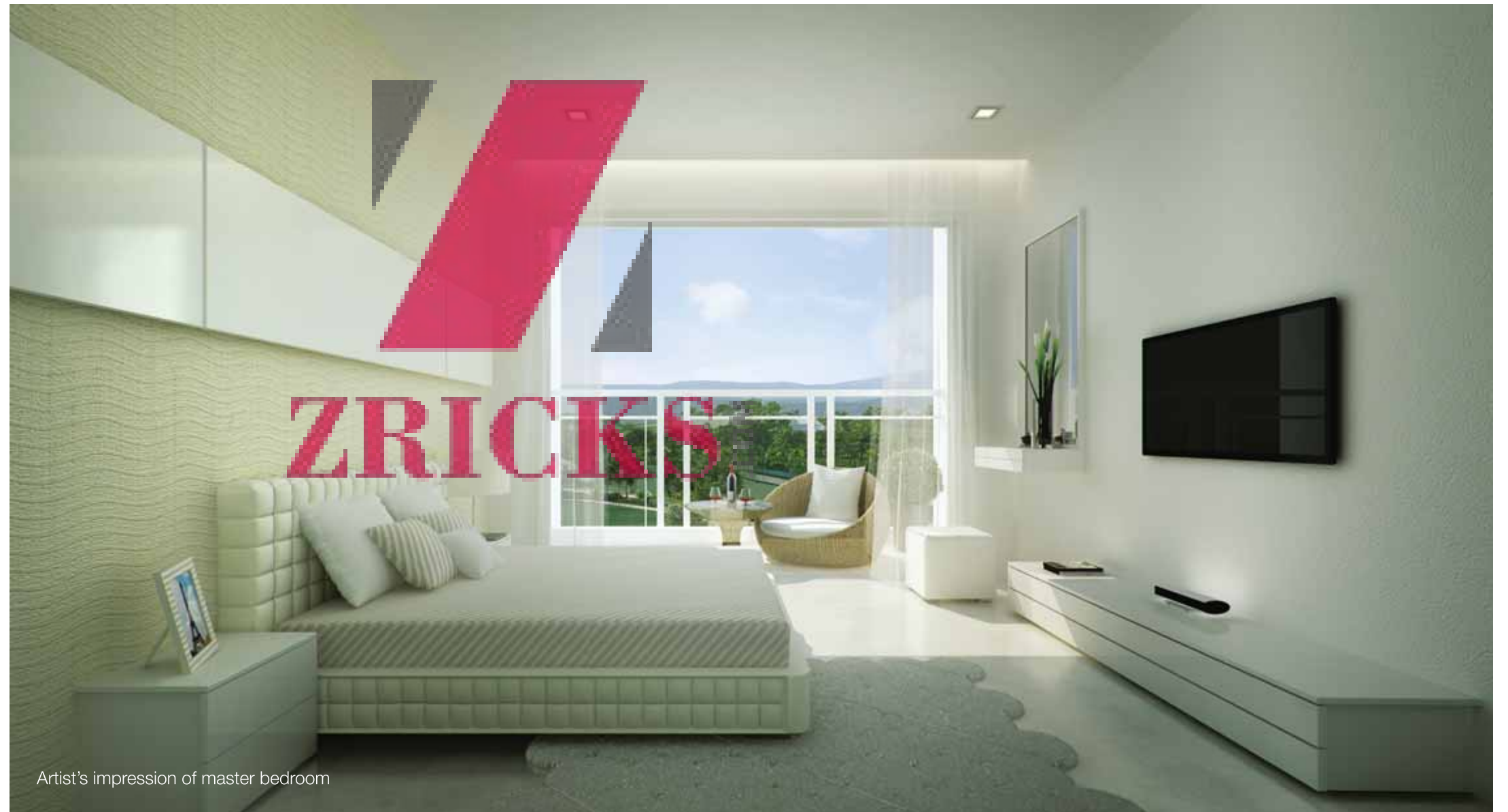
Artist's impression of master bedroom

Here, the idea of comfort goes beyond the notion of physical relaxation. The aesthetically pleasing and spacious bedroom is an opportunity to offload your stress and wake up refreshed. The innovative layout creates an uncluttered space and a clean look - providing you with more storage and a lot of breathing space.