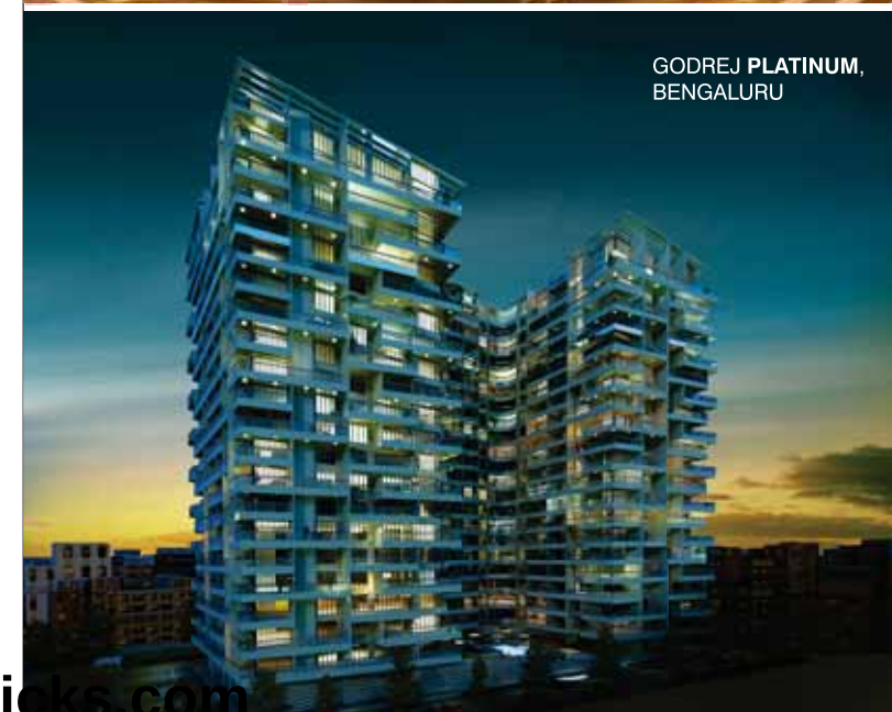
GODREJ PLATINUM, BENGALURU