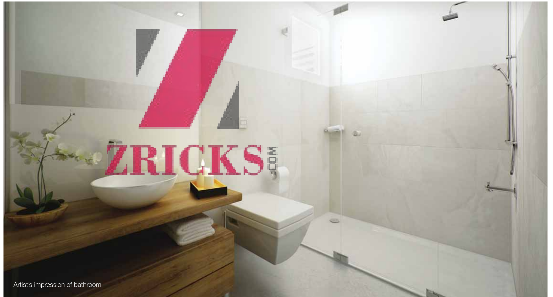
Artist's impression of bathroom

The place where you start and end your day deserves a lot of attention. Which is why, every bathroom is equipped with only the best installation for your relaxation while minimizing water consumption.