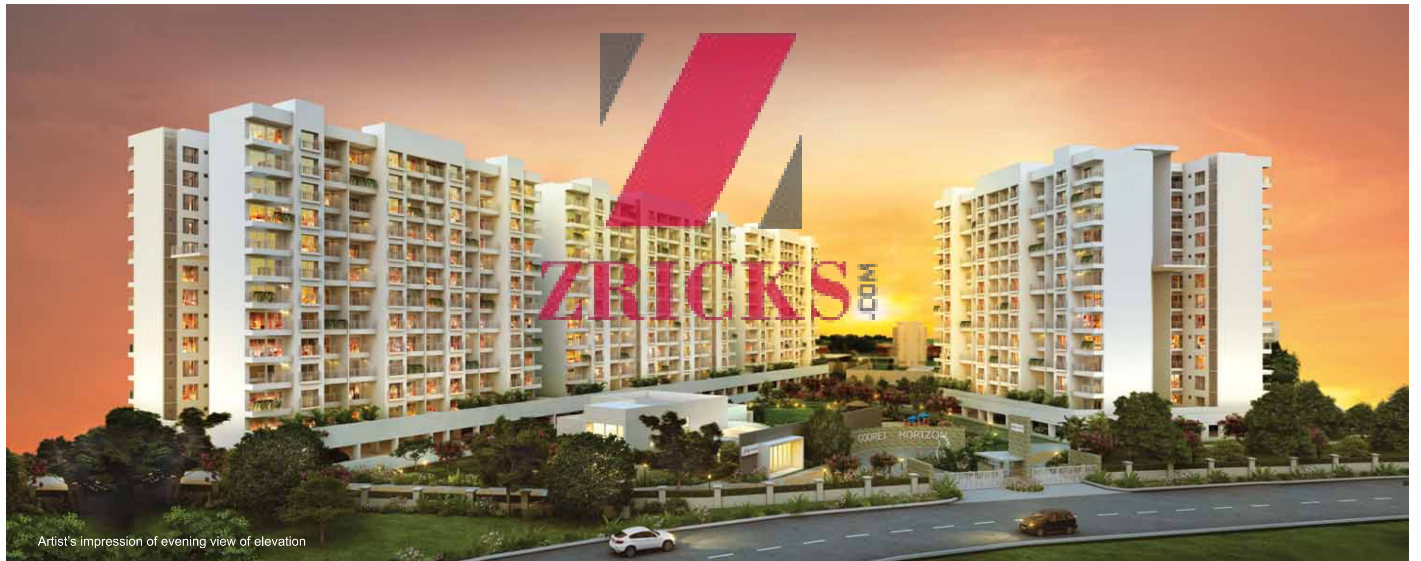
Artist's impression of evening view of elevation

Select first-floor apartments enjoy the luxury of their very own attached private gardens. In addition to the spectacular views of the hills, you can indulge your horticultural interests and grow a variety of exotic plants and flowers in your own garden – a rare privilege in today's times.