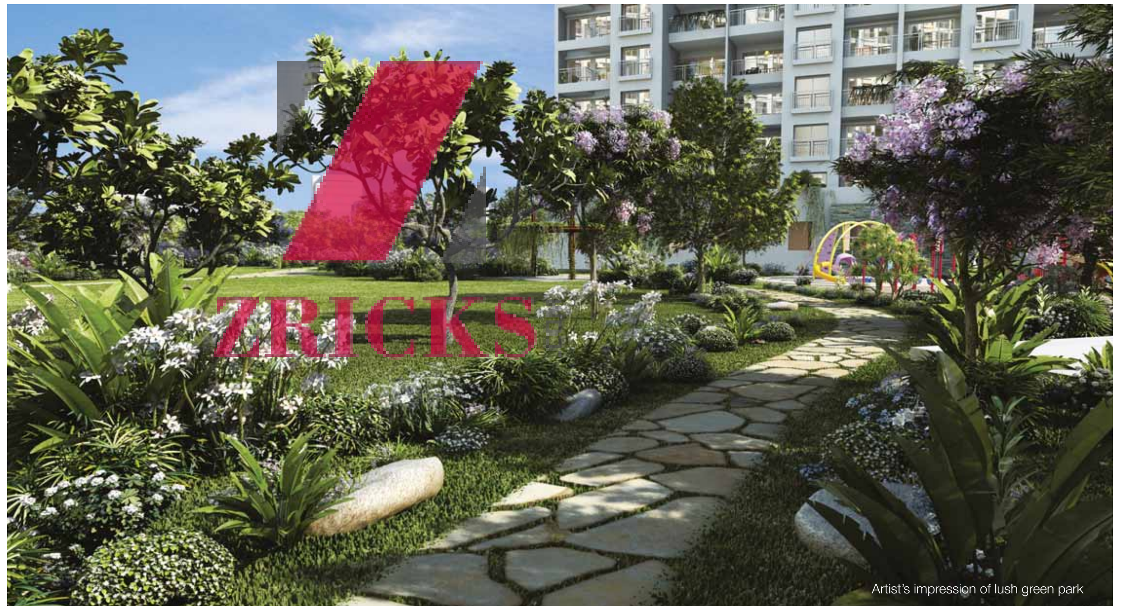
Artist's impression of lush green park

And the best part - all of this is right in your backyard.