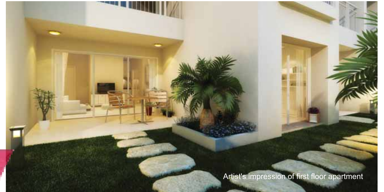
Artist's impression of first floor apartment

The process of maintenance is integrated into design from the very beginning. Every home is fitted with powder-coated aluminium windows to shield it from rainwater and heavy pollution. A combination of several smart techniques will keep Godrej Horizon in mint condition for times to come.